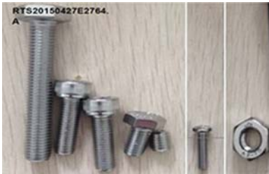
Samples After Test